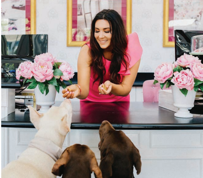
◀ Cooke treats guests at the Yuppy Puppy check-in desk, which would look just at home in a hotel for humans.